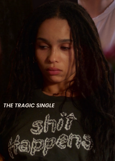
THE TRAGIC SINGLE