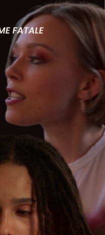
THE FEMME FATALE