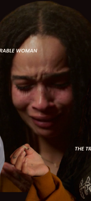
THE VULNERABLE WOMAN