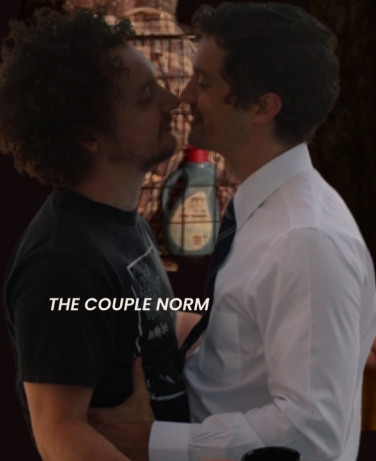
THE COUPLE NORM